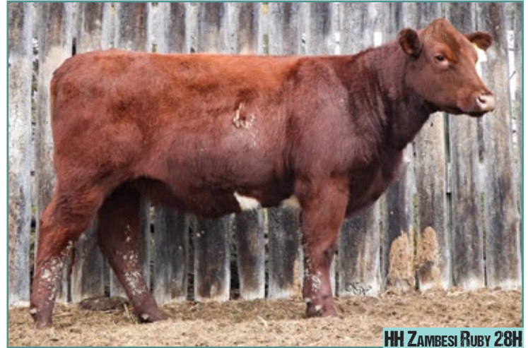
HH ZAMBESI RUBY 28H

Muscle + milk + easy fleshing + stlye + structurally sound = BROOD COW!!!! This heifer has it all and then some. Out of a big red Y Lazy Y cow that produces keeper heifers everytime. Miner 10D has left some pretty amazing daughters. You can't help but drool when you see all his dark cherry red progeny standing in the field. The 3 Miner heifers in the sale are very powerful, just like their dad. Miner 10D has had the biggest impact on my herd in terms of getting the BEEF back in this breed. I would love the whole herd to be just like this. The Miner daughters are very hard to part with. Pasture exposed to Countryside Conroy 91C, June 20 - August 23, 2021