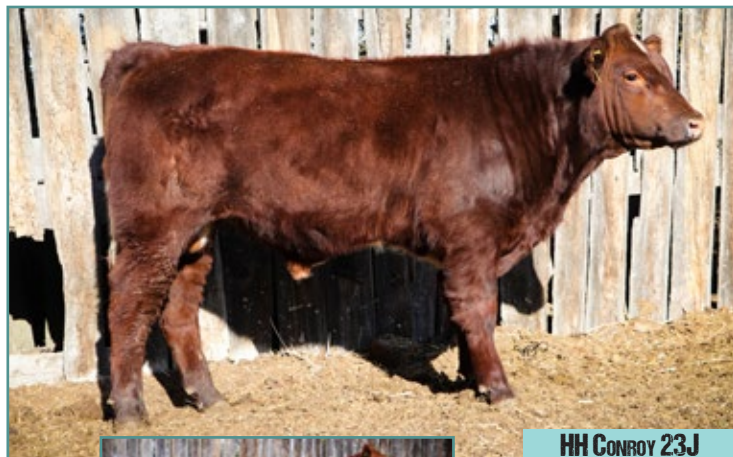
HH CONROY 23J

A smooth polled, stout bull calf out of a consistent producer. 39A is a moderate framed, good milking cow that is worth building a herd around.