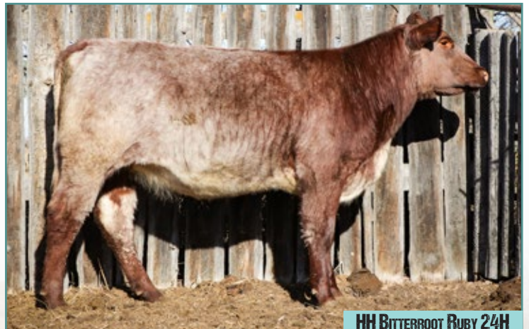
HH BITTERROOT RUBY 24H

A very attractive heifer with growth and muscle. She is out of a deep sided, good milking and docile cow. The 410B cow is one of the top cows in the herd. I think so highly of this heifer's mom that I kept her 2021 bull calf for myself as my future herdsire. Pasture exposed to Countryside Conroy 91C, June 20 - August 23, 2021