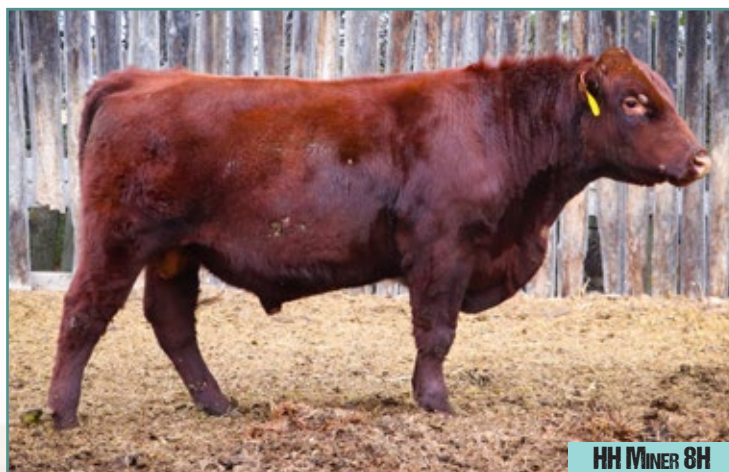
HH MINER 8H

TOP 10% - CE, BW & YW | TOP 4% - WW | TOP 2% - Milk & TM