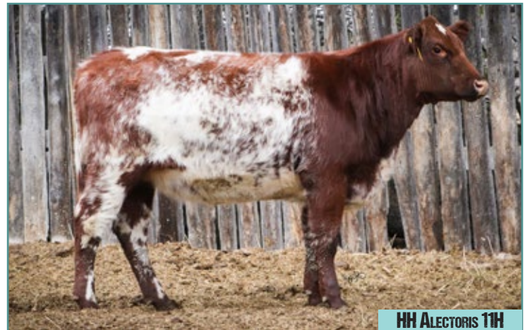
HH ALECTORIS 11H

The sleeper of this sale. This young Adam daughter is packed with performance, growth and good mothering ability. She may not look like it now, but she has the potential to be an extremely productive female! Her maternal granddam produces very stylish heifers and is currently in the flush pen.