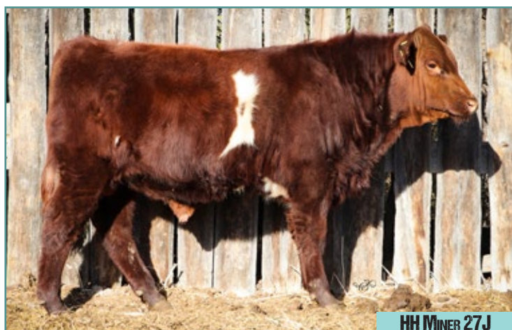
HH MINER 27J

My pick of the bull calves. This calf has inherited his mother's deep heartgirth, easy fleshing and low maintenance style combined with his exceptional growth, long body and muscular hip from his daddy. His calm disposition makes him an ideal herdsire and show prospect! Lots of hair and eye appeal. He is a TANK. He has a really great future ahead of him.