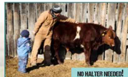
NO HALTER NEEDED!