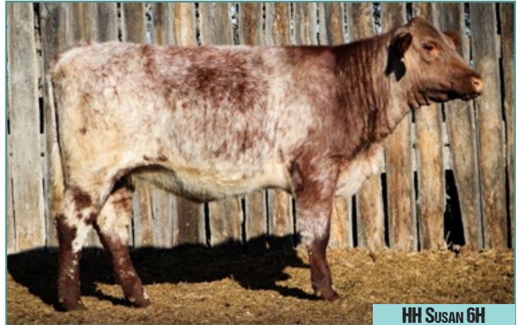
HH SUSAN 6H

A great grand daughter of Four Point Major! Purebred breeders, what an incredible genetic opportunity! This heifer's dam keeps on producing even though she is getting up in years. The Susan line milks very well, while still staying in great shape. They are sure footed in the toughest terrain and consistently bring in a calf every year. These are the type of cows that make commercial producers money!!! Pasture exposed to Countryside Conroy 91C, June 20 - August 23, 2021