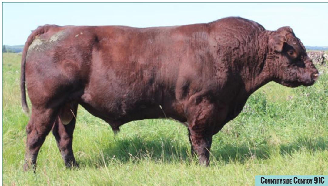
COUNTRYSIDE CONROY 91C