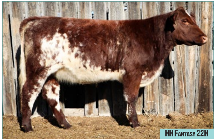
HH FANTASY 22H

Another refined and stylish Adam heifer. Moderate framed and easy fleshing. This girls dam, 78Z is one of the quietest cows in the herd. As well, 78Z has performance stacked in her pedigree.