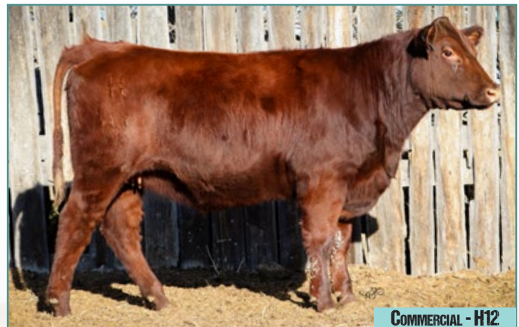
COMMERCIAL - H12

This heifer shows what a little shorthorn in every commercial producer's herd can do. Shorthorns add growth, muscle, femininity, milk, good feet and legs and superior mothering ability. PLUS, she is a dark cherry red and is so nice look at! Wouldn't you want a bunch of 1/2 or 3/4 blood heifers like her?