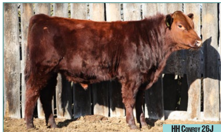
HH CONROY 26J

Deep sided, smooth polled, cherry red, thick and very correct. This long bodied, wide topped, well muscled calf will sire calves that stand out in any pen. A real smooth mover too!